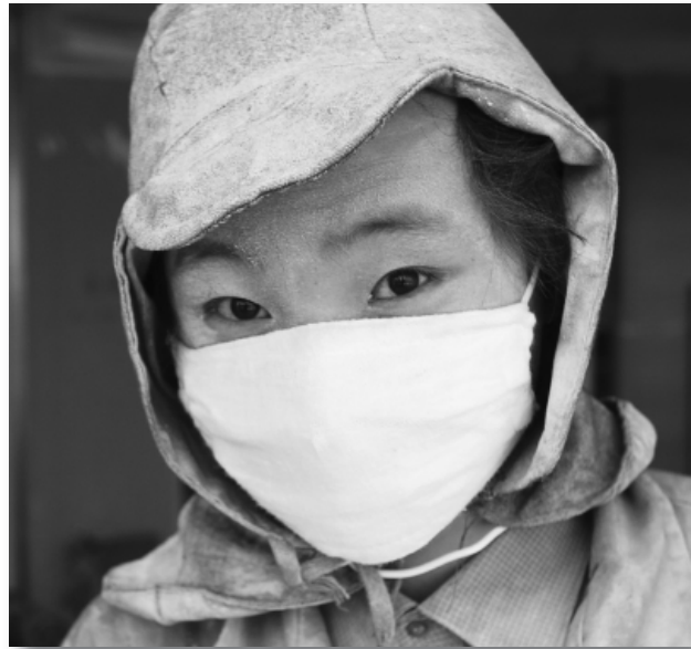
WORKER: The senior managerial staff of the personnel department. 29